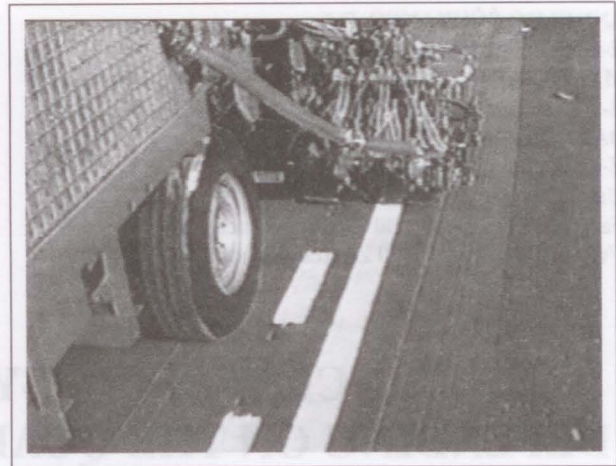
Figure 2 – Non-profiled line made of thermoplastic material

Road markings have the task of visually guiding the driver, owing to which the driver can foresee the route of safe movement. The quality and quantity of visual guidance depends directly on the visibility so that reflexive properties of road markings are of basic significance. The presence and quality of the road markings affects the speed as well as the position chosen by the drivers.