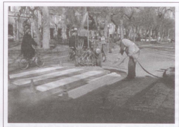
Figure 3 – Transversal road markings

Road markings should first of all facilitate the performance of operative tasks, but should also affect the tactical tasks. The markings represent the best aid in lateral, that is, transversal positioning of the vehicle. Therefore, the drivers focus their attention often on the markings that are intentionally used for central observation, and in that case the markings are extremely significant, especially in conditions of reduced visibility.