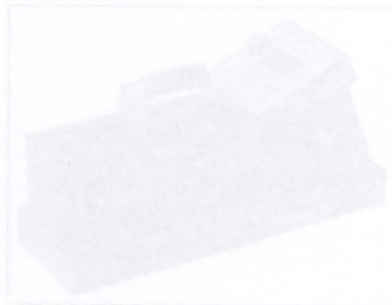
Figure 4 - Retroreflective ZENITHER ERM 1013+ for testing road marking quality