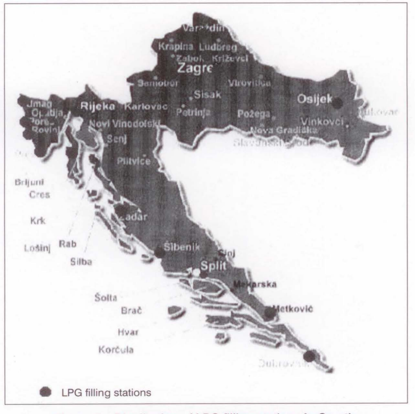
Figure 2 - Distribution of LPG filling stations in Croatia

Liquefied petroleum gas which is used as car fuel directly helps the environmental protection, so that LPG propelled cars are environmentally friendlier.