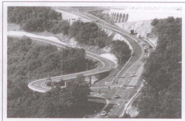
Figure 1 - Road Traffic Routes in the Rijeka Traffic Junction

The road cargo transport routes correspond to the distant traffic itineraries towards Bakar, i. e. the Rijeka Traffic Junction. These are the routes from the continental hinterland, i. e. Central and Eastern Europe, which primarily exist as two access routes from Zagreb and Ljubljana and, secondarily, from Dalmatia and Istria. In the future, the Rijeka Traffic Junction access roads, together with the motorway links, will be integrated into the Rijeka By-pass Road. The