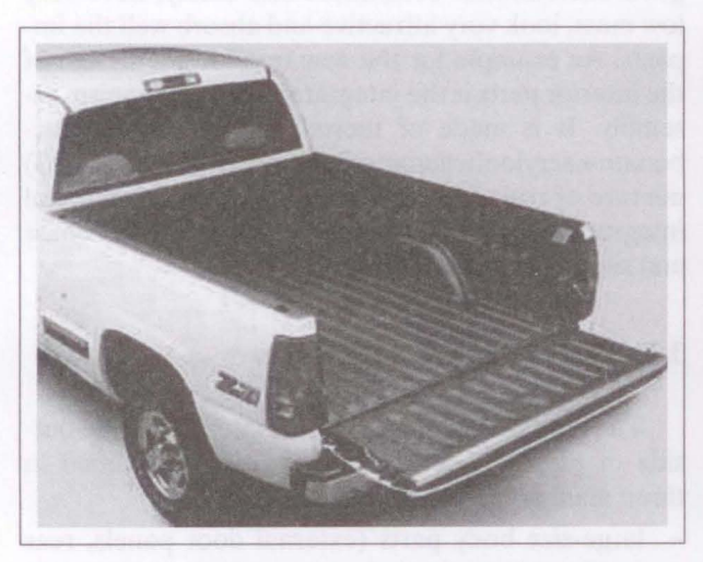
Figure 2 - Loading platform of a light pick-up truck (General Motors)

Table 1 - Systemic presentation of the internal automobile parts and polymeric materials of which they are made [10]