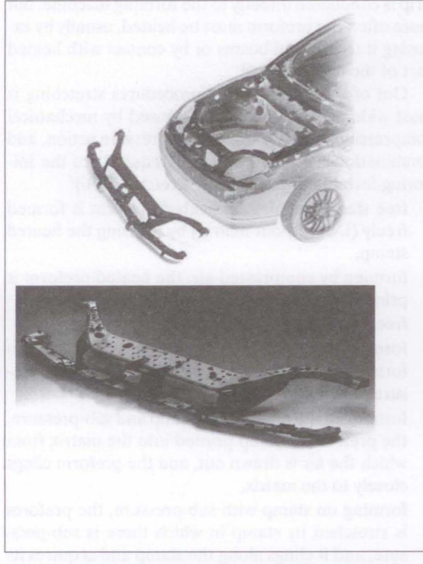
Figure 4 - Front transversal support, Ford Focus [14]

Table 4 - Systemic presentation of structure parts and body and the polymeric materials of which they are made [10]