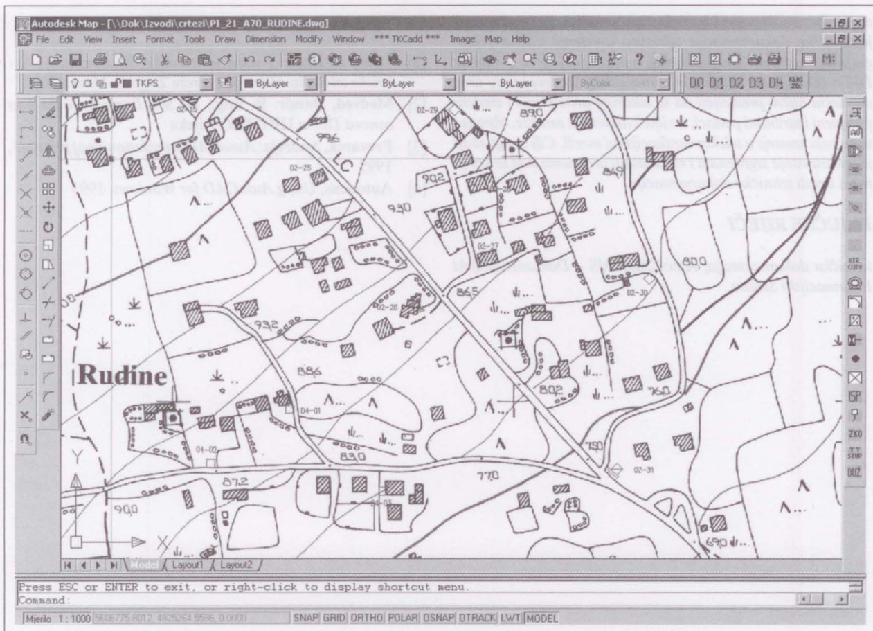
Figure 2 – Digitised cable terminals of Split RSS Rudine