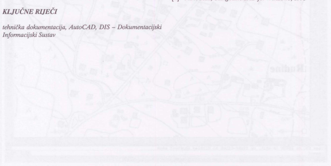
Figure 7 – Digitized cable terminals of Split PDS Rijeka

The development of information technology, new tele networks and the use of digital networks have enabled a much faster development of technical documentation which is capable today of following the fast development of telecommunication systems and of providing specific solutions which are in actual use in operation.