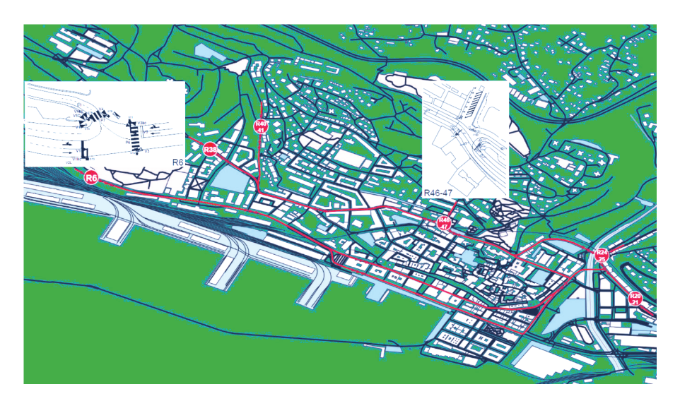
Figure 3 – Selected roads with the highest traffic volume in the city of Rijeka

Table 1 shows the input data of six selected roads in Rijeka, singled out from the city road network as roads with the highest traffic volumes based on the defined criteria of the number of motor vehicles in