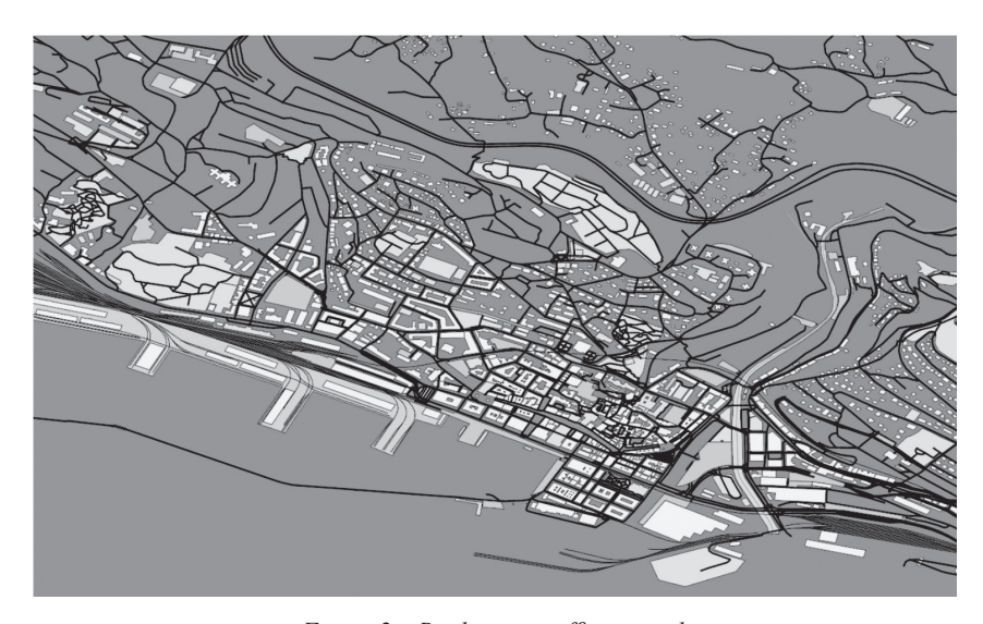
Figure 2 – Rijeka city traffic network