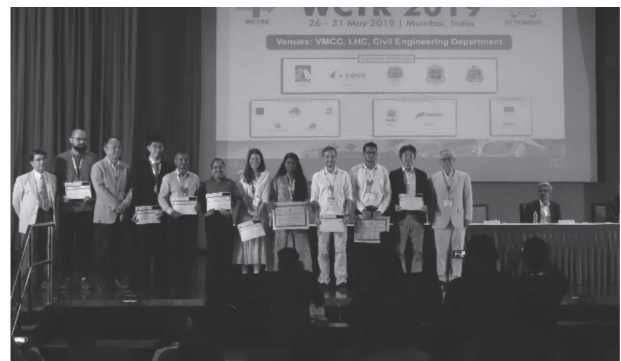
Prize and award winners at the Closing Ceremony of the WCTR2019