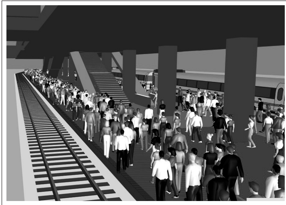
Figure 3 - Emergency evacuation begins when the train arrives at the station