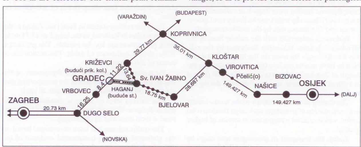
Figure 1 - Railway route Gradec - Sveti Ivan Žabno

Two stops are planned along the track. The stops are planned in the vicinity of road crossings between villages, so as to provide easier access for passengers.