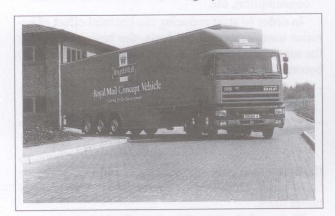
Figure 3 - "Green" truck of the British Royal Mail

ides (NO<sub>x</sub>). With this aim the British Royal Mail has started to co-operate with several well-known vehicle manufacturers (Volkswagen, Ford, DAF, Renault). The result of this co-operation are the "green" vehicles, as they are called (Figure 3). They feature improved aerodynamic properties, strong catalytic converters, and they use special high-quality engine oil. Special clutches have been designed for these vehicles, controlled by means of an installed microprocessor, and they react automatically to the variations in vehicle speed. The testing results showed that such vehicles reduce fuel consumption in urban traffic by about 14 percent and in out-of-town traffic by 18 percent. Besides, the "greens" generate less noise than the usual vehicles of the same category.