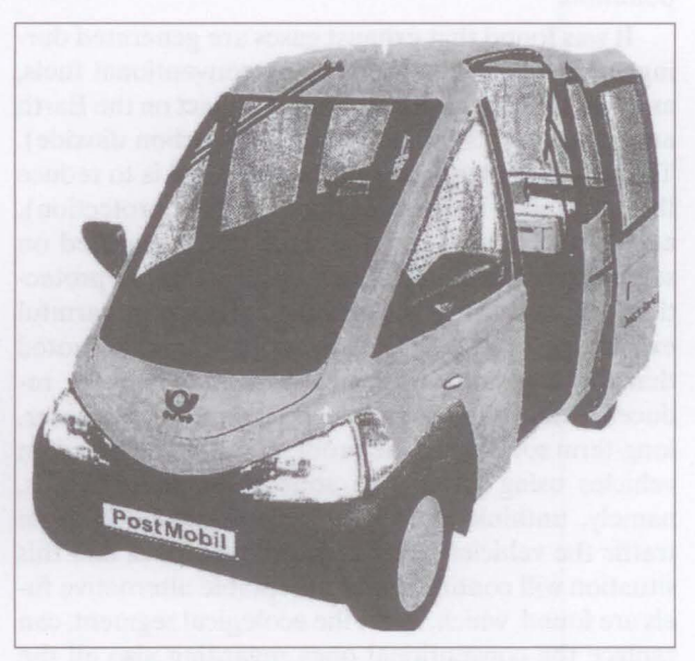
Figure 4 - Electric car "PostMobil" of the German Post

After having carried out certain analyses, the German Post came to the conclusion that, considering both mentioned requirements, the best solution would be to use electric vehicles. The German Post is studying the operation of two types of vehicles: vehicles of 400 kg capacity and vehicles of up to 1,500 kg capacity. The vehicle was named "PostMobil" (Figure 4).