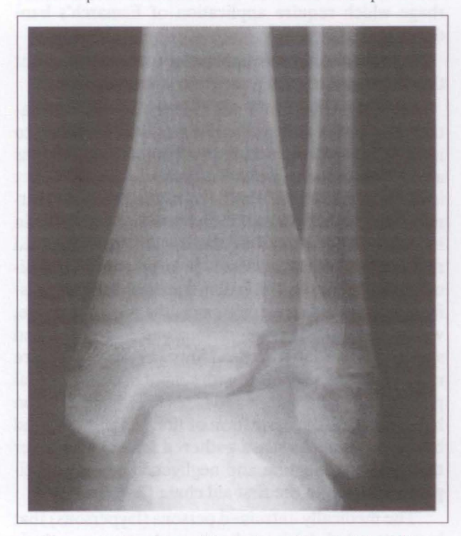
Figure 2 - Fracture of the external part of the tibia and the ankle joint

for the exam in first aid. The curriculum provides also the training in the basic principles of administering first aid in the form of immobilisation of the injured part of the body. The analysis of the gathered data has resulted in a disappointing fact about the poor quality of administering first aid by the laypersons, including the ignorance and failure of engagement in cases when the transport immobilisation is of extreme importance.