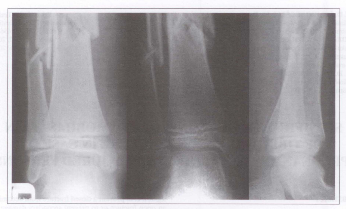
Figure 1 - Fracture of both lower-leg bones

for the exam in first aid. The curriculum provides also the training in the basic principles of administering first aid in the form of immobilisation of the injured part of the body. The analysis of the gathered data has resulted in a disappointing fact about the poor quality of administering first aid by the laypersons, including the ignorance and failure of engagement in cases when the transport immobilisation is of extreme importance.