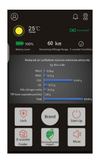
b) Histogram-based information stating "Saved air pollution source emissions by this ride

Figure 1 – Screenshots of two different types of information designed in the app