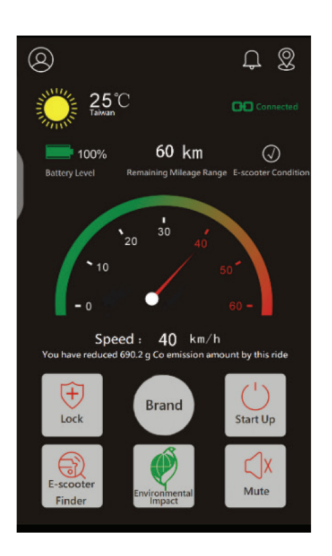
a) Text-based information stating "You have saved 690.2 g of CO emissions by this ride"