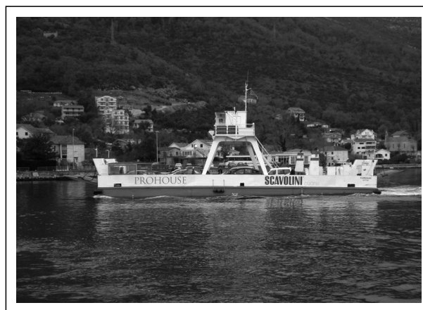
Figure 1 - Ferryboat "KAMENARI"

or maintenance of transport means, will be exposed to increased level of noise [2]. A typical example are employees who perform their work activities as sailors on ferryboats for transport of people and vehicles. In this particular case, it is about employees who work as "sailors" on ferryboats owned by the company A.D. Pomorski saobraćaj - Kotor. Damage to hearing organs of employees who have been working as sailors for more than four years has been noticed through regular medical examinations of employees. Statistically speaking, the level of 5% of employees with reduced ability to detect sound signals does not represent a significant value and an alarming data, but suggests the fact that it is necessary to do a risk analysis of increased noise exposure on a particular work position. An experiment has been conducted for this purpose, in which noise risk assessment has been carried out for sailors who work on "KAMENARI" ferryboat, which runs on Kamenari - Lepetane route. The ferry "Kamenari" was originally used as navy artillery assault raft that in 1966 was adjusted for ferry service in the military shipyard "Arsenal". Regardless of the age of almost five decades, thanks to very good maintenance, this ferry is still being actively used (Figure 1).