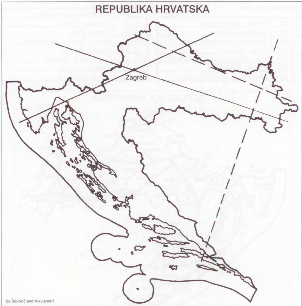
Figure 2 – The railway strategic cross with transversal North – South (Botovo – Rijeka) and longitudinal (S.Marof – Vinkovci) as main development axes and two alternative routes (B.Manastir – Bosnia and Herzegovina – Ploče and Varaždin – Osijek – SRJ)